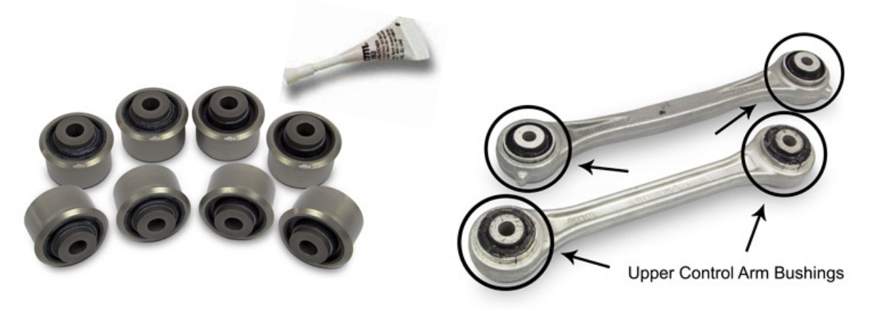
Rear Control Arm Upper Sealed Monoball Kit

Our fully sealed monoball cartridge kits feature maintenance free PTFE linings requiring no supplemental lubrication. We've designed in weather seals to keep dirt out and extend product life. This is the only monoball suitable for street or extended track use. Dirt and water contaminate ordinary products and accelerate wear.